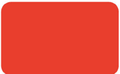
Traffic Red RAL 3020