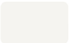
Traffic White RAL 9016