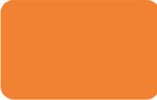
Vermilion RAL 2002