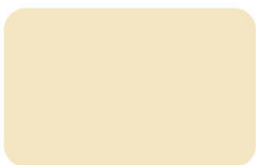
Ivory RAL 1014