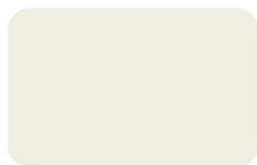
Oyster White RAL 1013