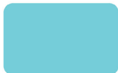
Light Green RAL 6027