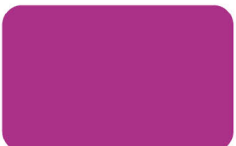
Traffic Purple RAL 4006