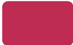
Red Violet RAL 4002