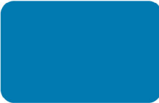
Traffic Blue RAL 5017