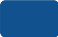
Night Blue RAL 5022