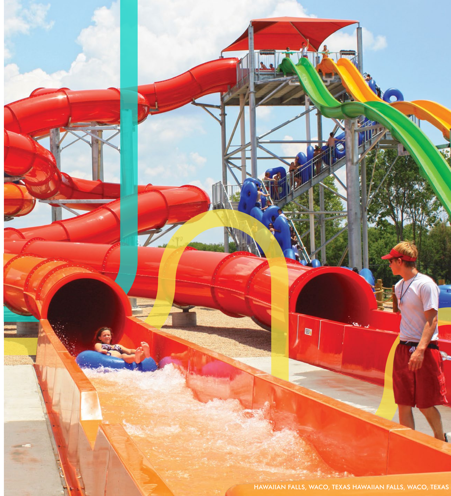
HAWAIIAN FALLS, WACO, TEXAS HAWAIIAN FALLS, WACO, TEXAS

Regular maintenance is worth the investment because it keeps large replacement costs down by extending the life of your product.