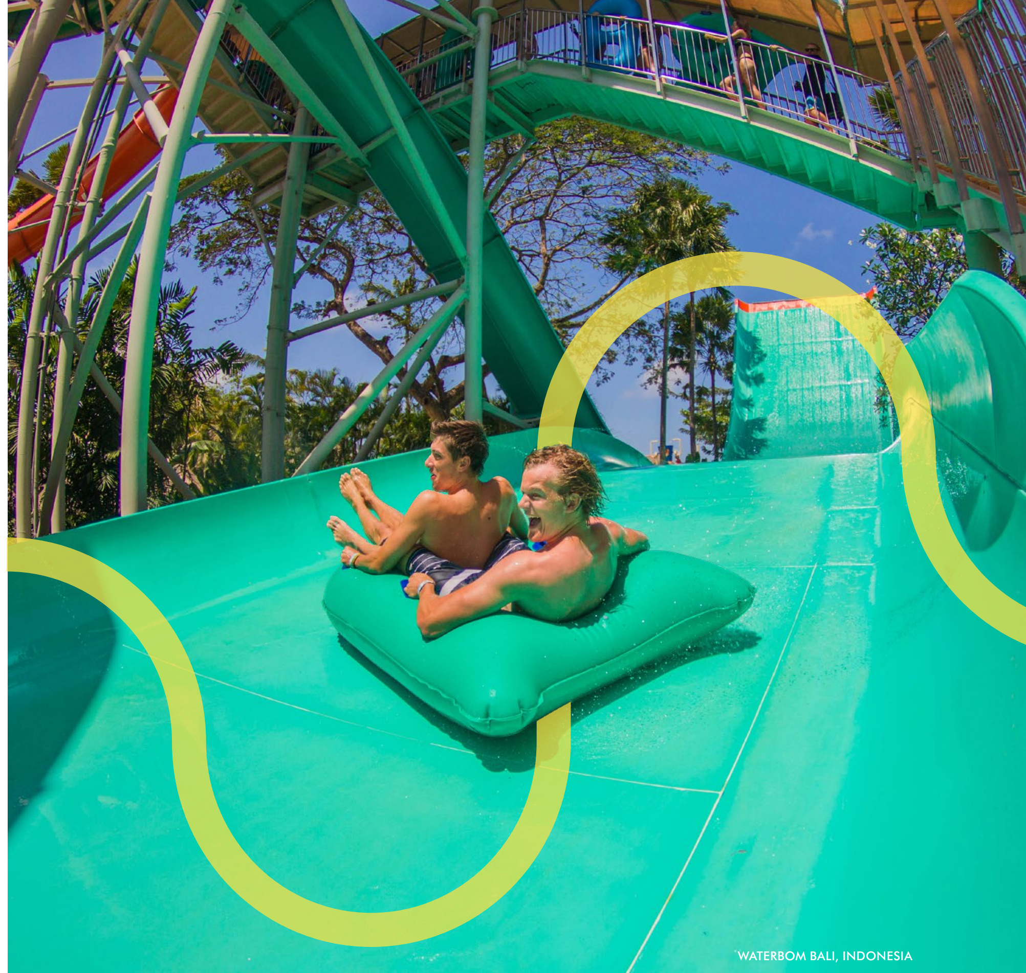
WATERBOM BALI, INDONESIA