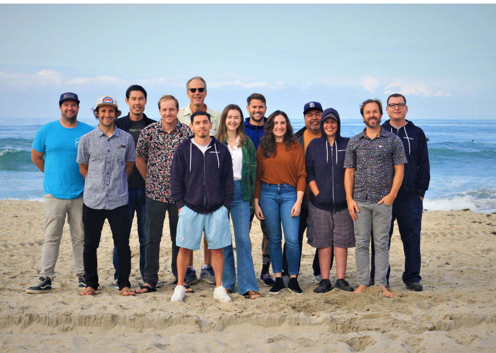
The FlowRider team who brought you FlowSurf