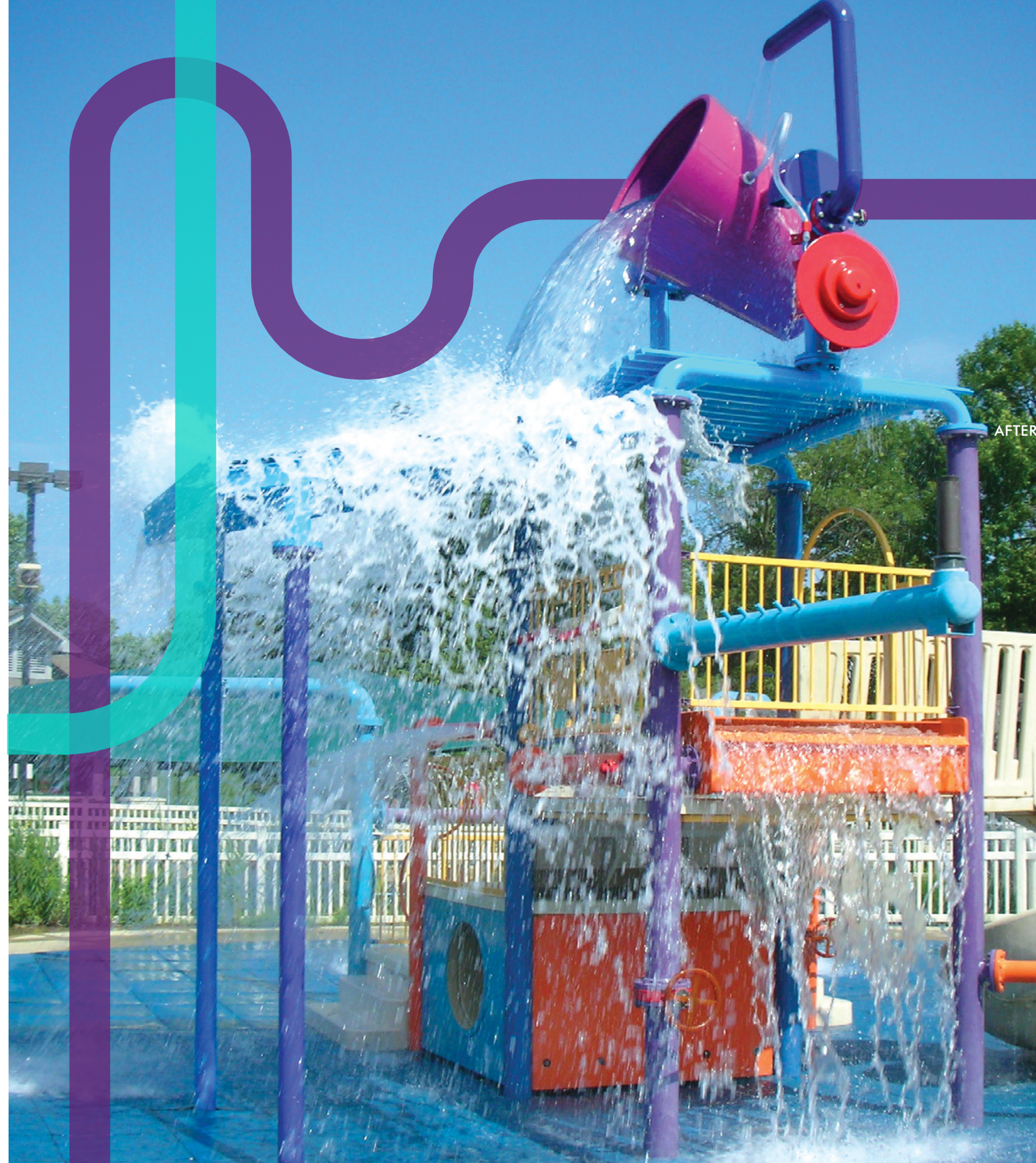
Highland Park, Illinois