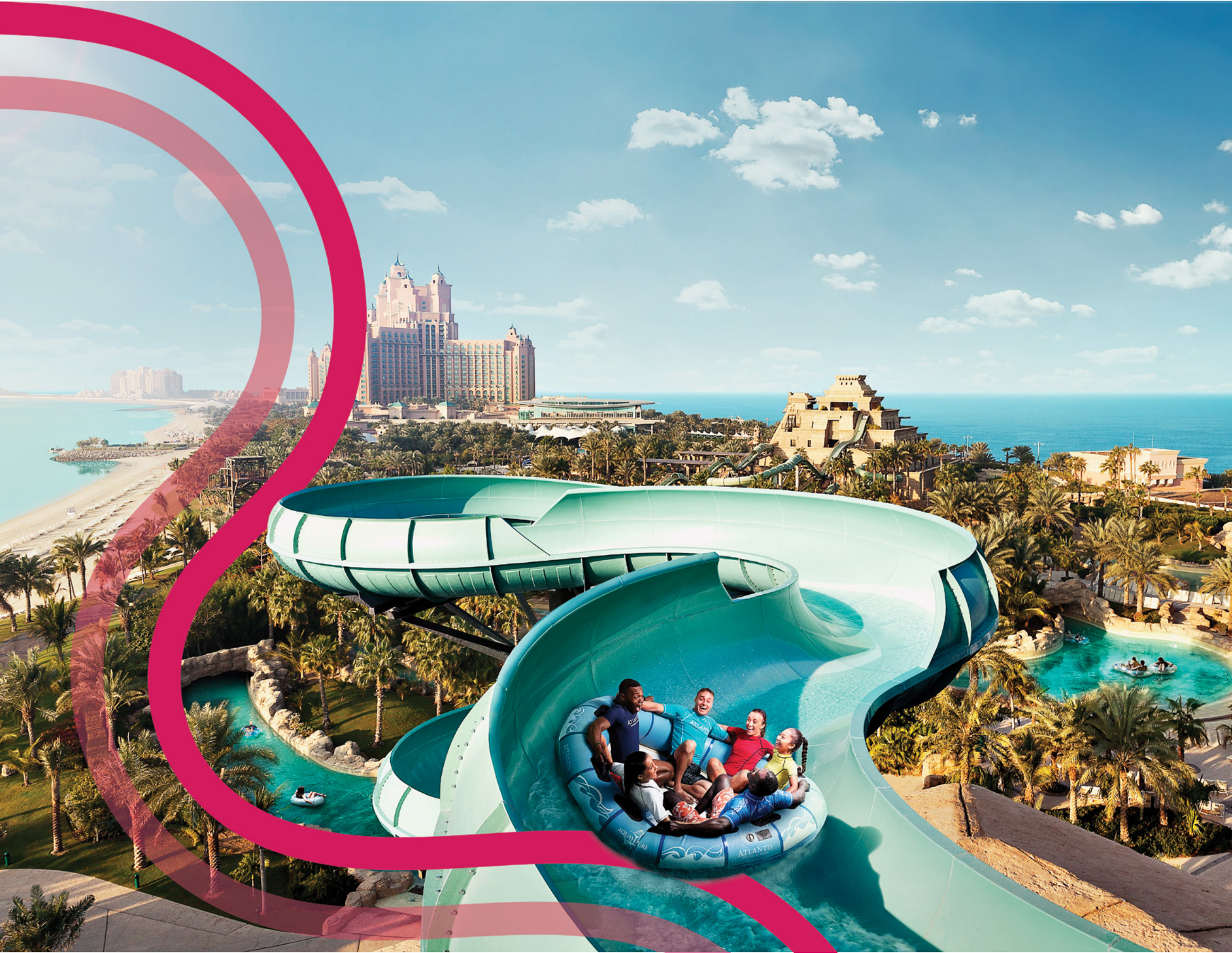
Overview (Aquaventure Waterpark at Atlantis The Palm - Dubai, UAE)

Located across the globe and speaking multiple languages, the Performance Services Team is ready to answer your maintenance and support requests 24 hours a day. Contact us to achieve high performance on your water park investment.