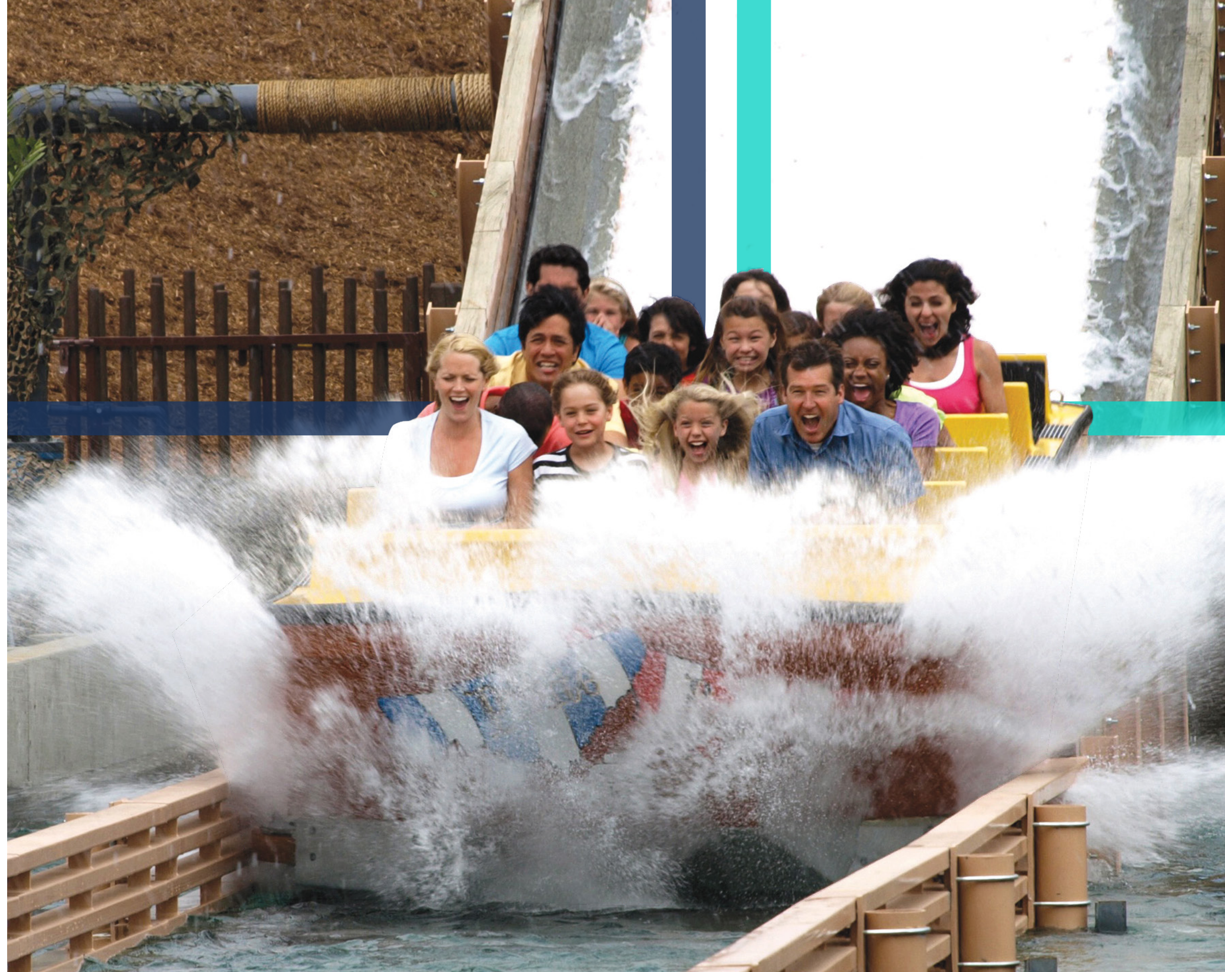
LEGOLAND® California Resort, Carlsbad, California