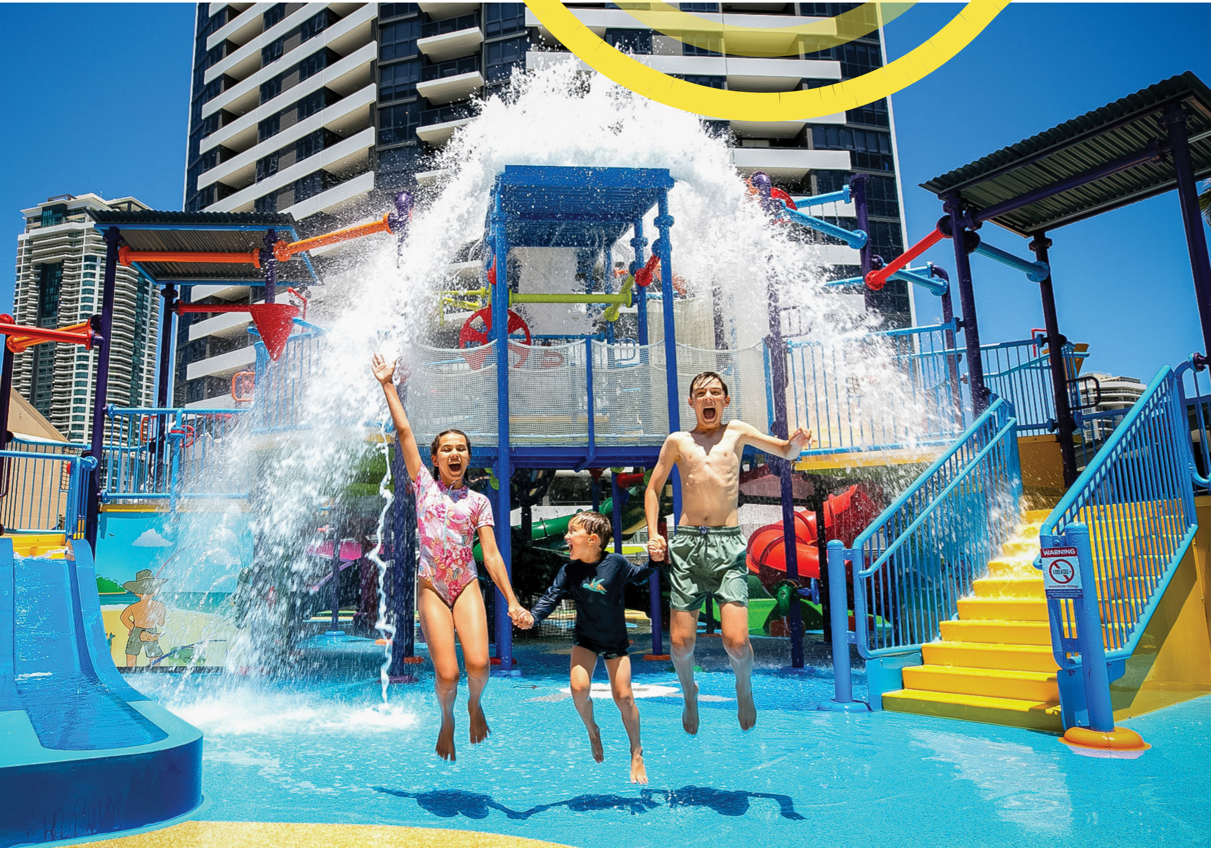
AquaPlay 1050 (Paradise Resort Gold Coast - Surfers Paradise, Australia)