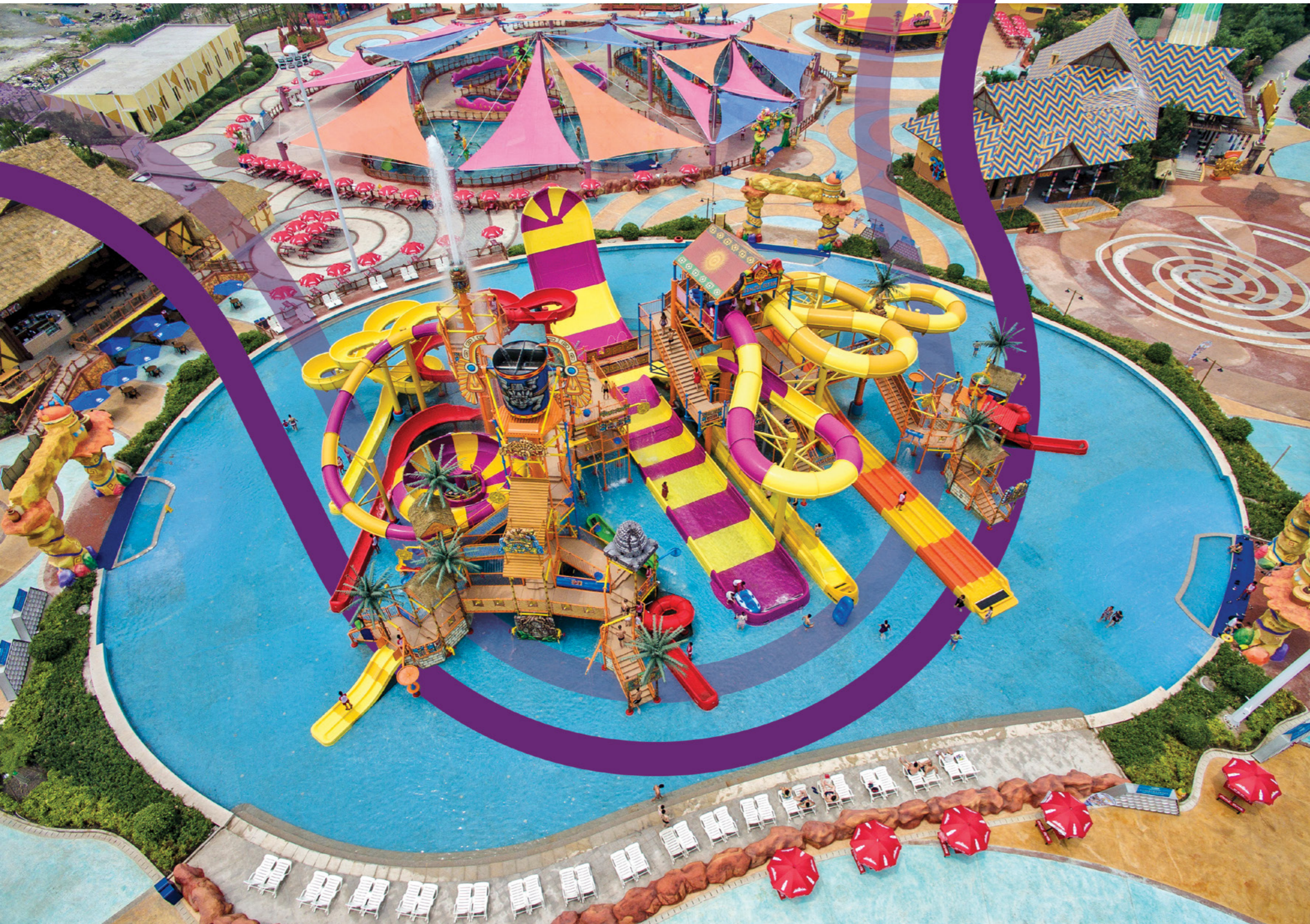
FusionFortress 17 (OCT Playa Maya Water Park Tianjin - Tianjin, China)