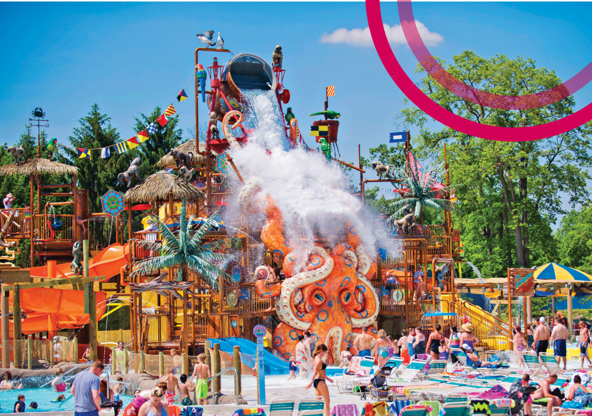
RainFortress 5 (Zoombezi Bay Waterpark at Columbus Zoo -Powel, USA)