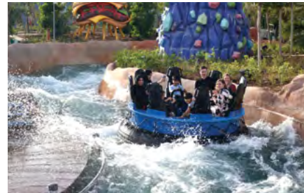
急速旋转泛筏、超级泛筏、河流泛筏等 Spinning Rapids Ride, Super Flume, River Raft Ride and more