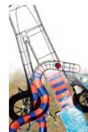
技术开发及工程设计

Concept, Schematic Design, and Design Development