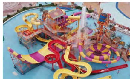
互动进阶性趣味水堡、巨型水寨、未来水寨等 AquaCourse, FusionFortress, AquaForm and more