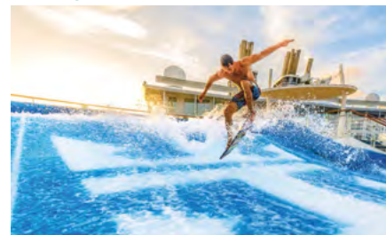
无极冲浪浪、冲浪模拟器 Endless Surf, FlowRider