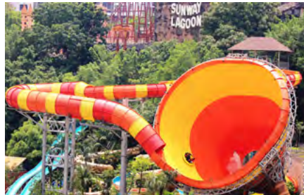
人体滑道、儿童滑道、合家欢滑道 Body Slides, Kid Slides, Family Raft Rides