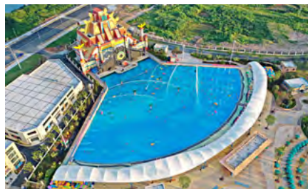
造浪池、造浪河 Wave Pools, Wave Rivers