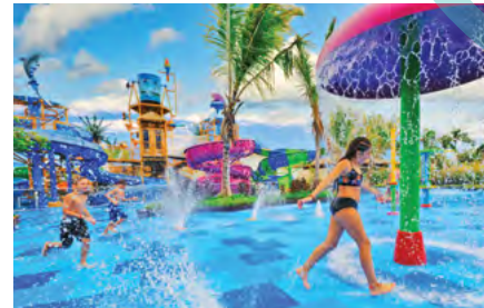
活力地垫，我们“推荐的”水上安全地板系统 Life Floor, our 'Recommended' Aquatic Safety Flooring System