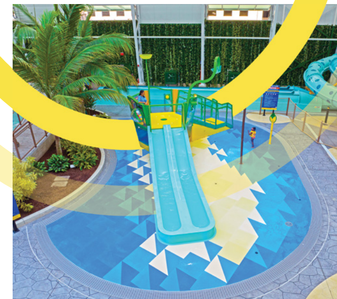
AquaForms (Island Waterpark at Showboat - Atlantic City, USA)