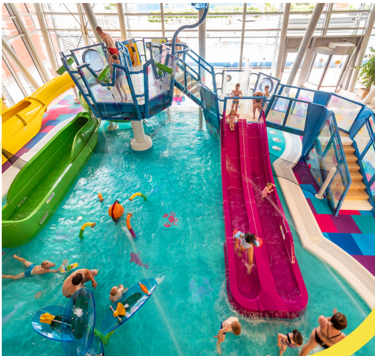
AquaForms (Aqualand Moravia - Pasohlávky, Czech Republic)