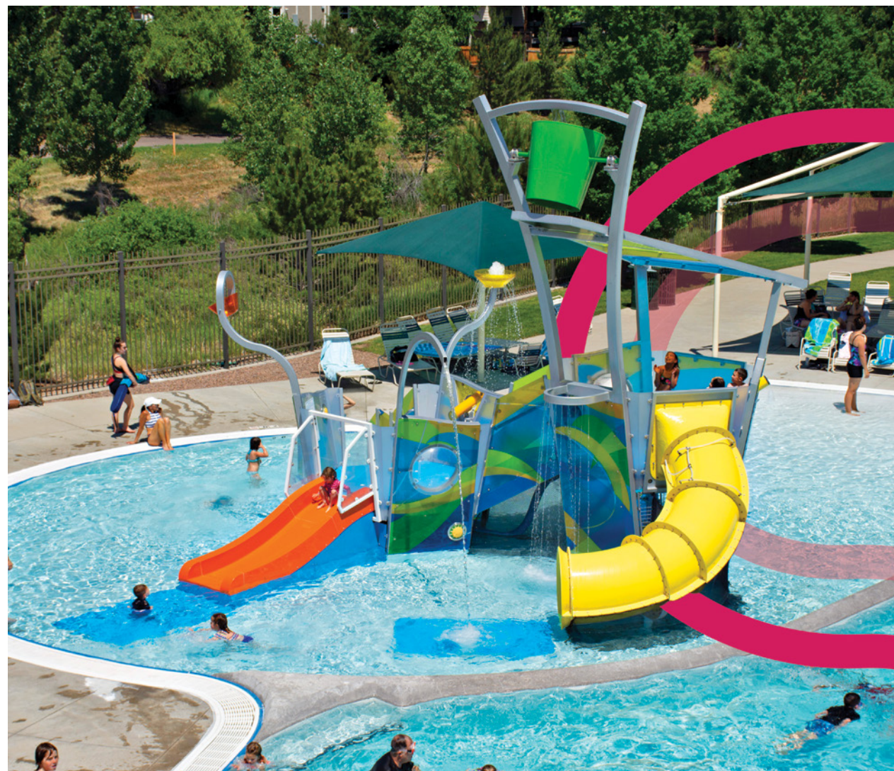
AquaForms (Cook Creek Park - Lone Tree, USA)

With clean lines, no flanges, and polycarbonate guardrails, AquaForms has a refined look that gives a bright and fresh feeling. Its translucent panels lend themselves to theming opportunities. Through 2D artwork, you can easily give your AquaForms a beachy feel or holiday vibes, or you can decorate it with elements from your brand, where guest pictures on social media would become instant advertisement for your venue. Because the panels are interchangeable, you can even decide on a new theme later to refresh the unit.