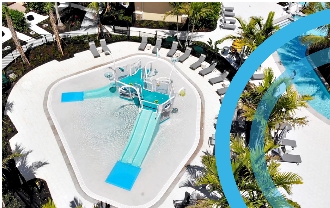
AquaForms (The Ritz Carlton Golf Resort - Naples, USA)