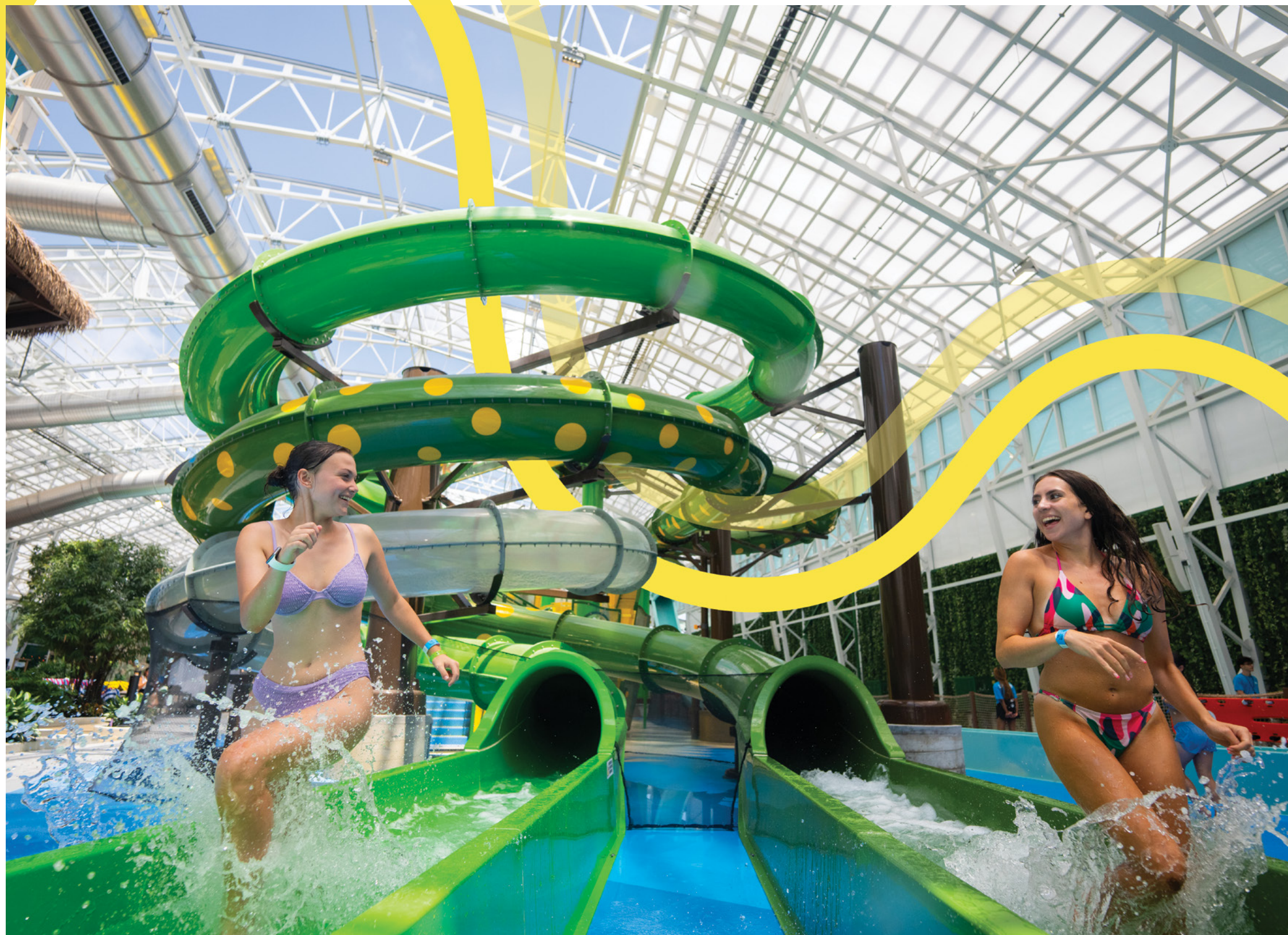
Elevated AquaForms 12 (Island Waterpark at Showboat - Atlantic City, USA)

Contact us at sales@whitewaterwest.com .