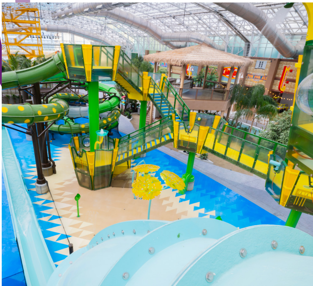
Life Floor on and underneath Elevated AquaForms 12 (Island Waterpark at Showboat - Atlantic City, USA)