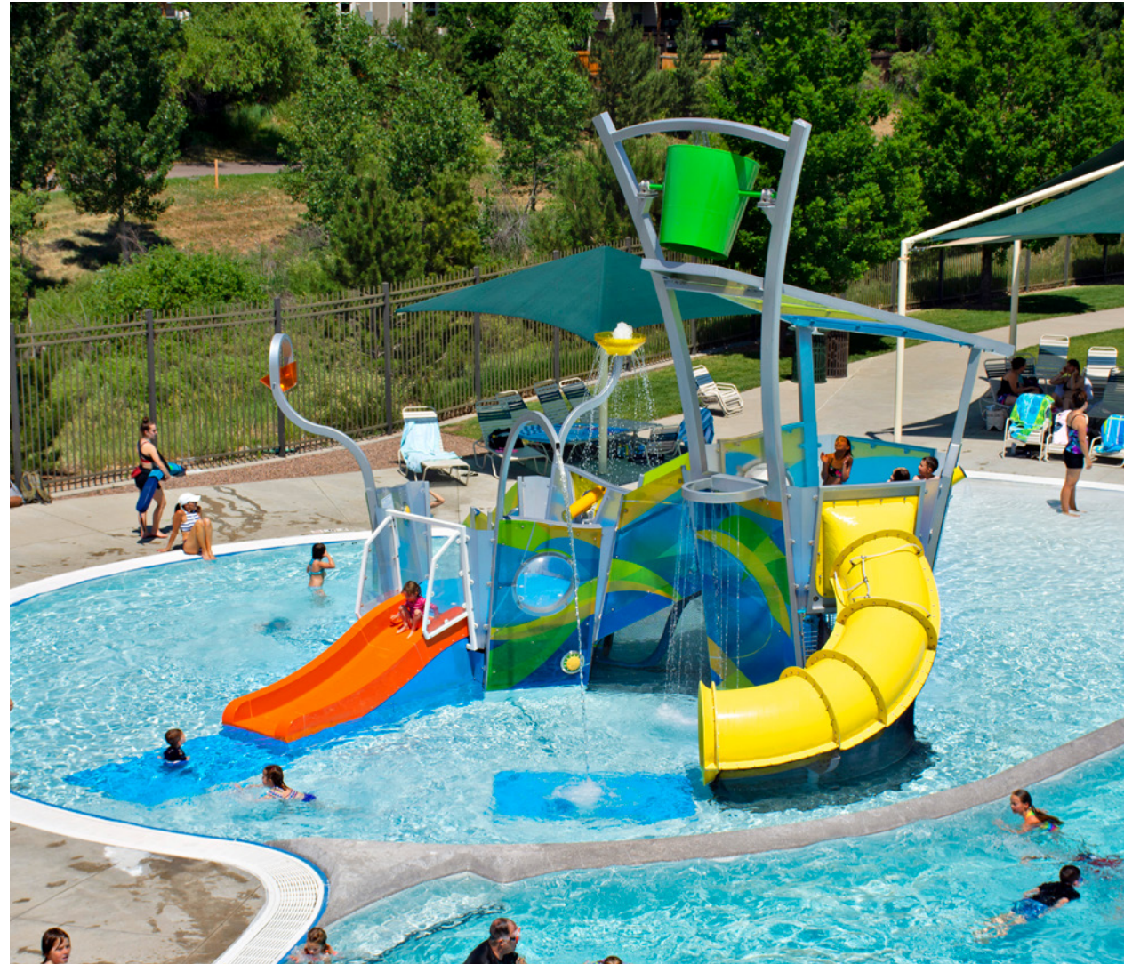
AquaForms (Cook Creek Park - Lone Tree, USA)

The configurability of AquaForms means that the structure can adapt to your pool, your architecture, your space, and your setting. You can build it around other features, for example, a lazy river, or raise it to place above a splash pad or existing amenities (see Elevated AquaForms on page 17 ). AquaForms can be compact or expansive. You can even decide to add more elements at a later point in time when your budget allows.