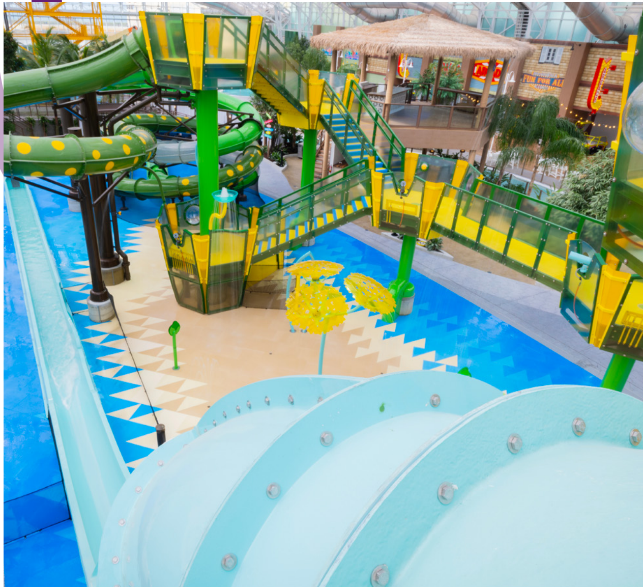
Life Floor on and underneath Elevated AquaForms 12 (Island Waterpark at Showboat - Atlantic City, USA)