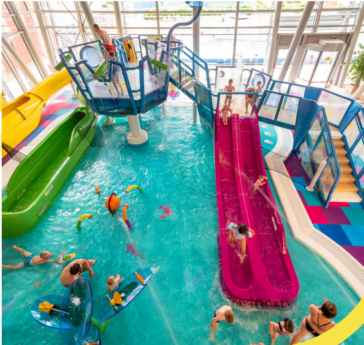
AquaForms (Aqualand Moravia - Pásohlávky, Czech Republic)