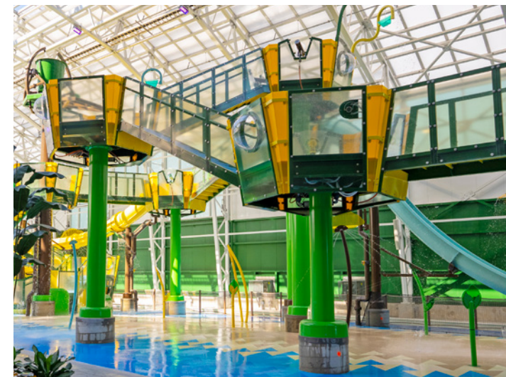
Elevated AquaForms 12 (Island Waterpark at Showboat - Atlantic City, USA)