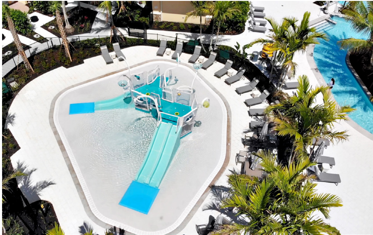
AquaForms (The Ritz Carlton Golf Resort - Naples, USA)