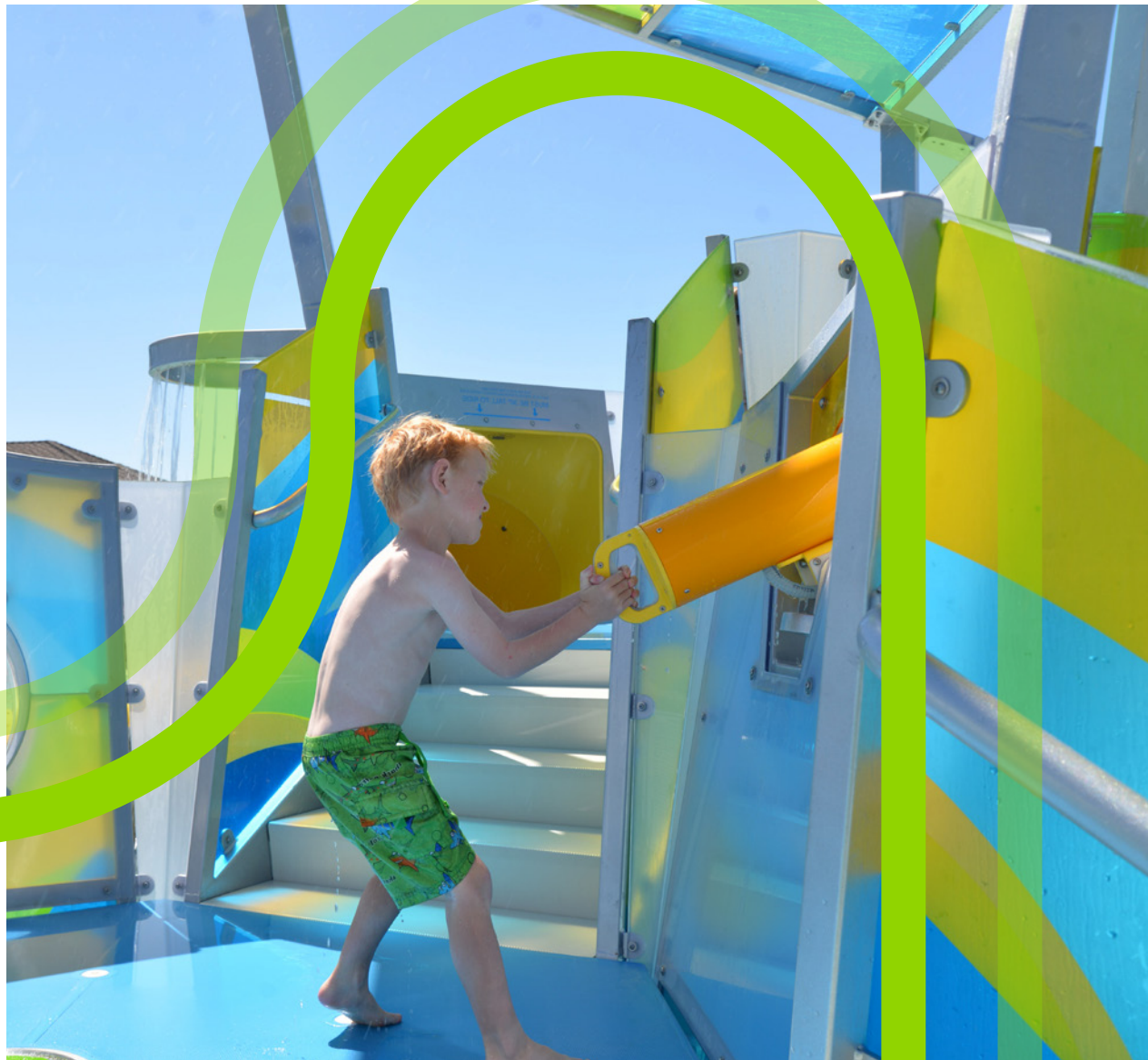
AquaForms (Cook Creek Park - Lone Tree, USA)