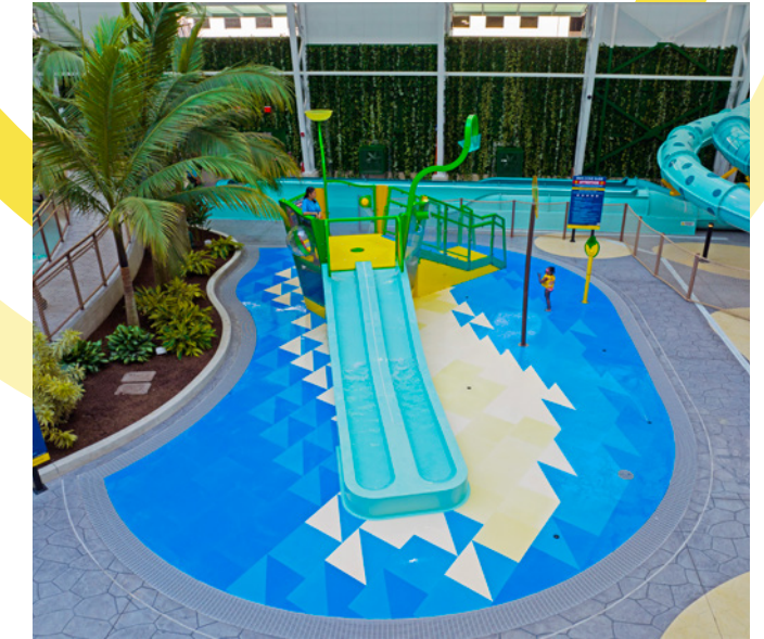
AquaForms (Island Waterpark at Showboat - Atlantic City, USA)