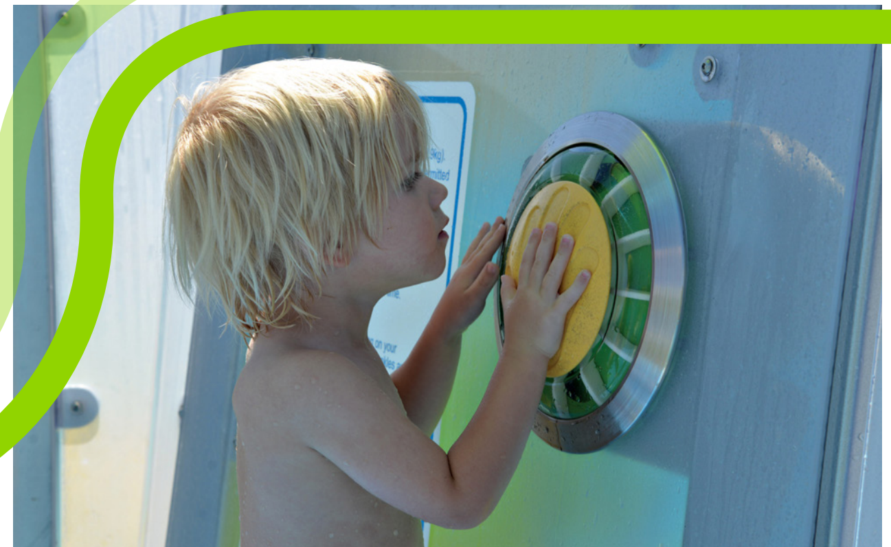
AquaForms (Cook Creek Park - Lone Tree, USA)

Because AquaForms' polycarbonate guardrails lend themselves well to artwork, the theming can represent a narrative that stirs children's imagination and spark make-believe play. Even better, with the optional Life Floor that can be designed to match or extend the theming, children can more easily invent stories with their playmates. Just think of what they can do with a theme of pirates or sea creatures.