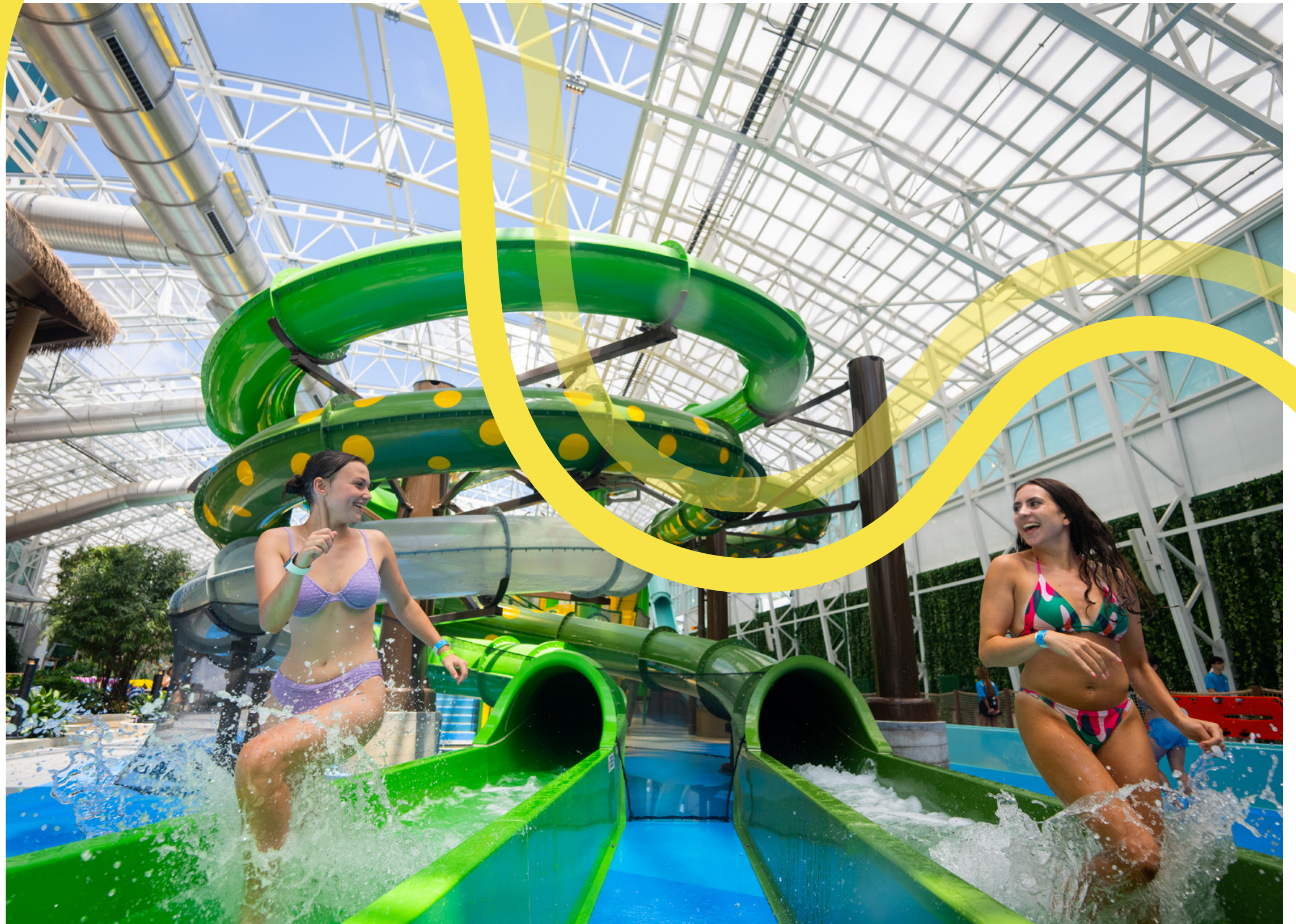
Elevated AquaForms 12 (Island Waterpark at Showboat - Atlantic City, USA)

Contact us at sales@whitewaterwest.com .