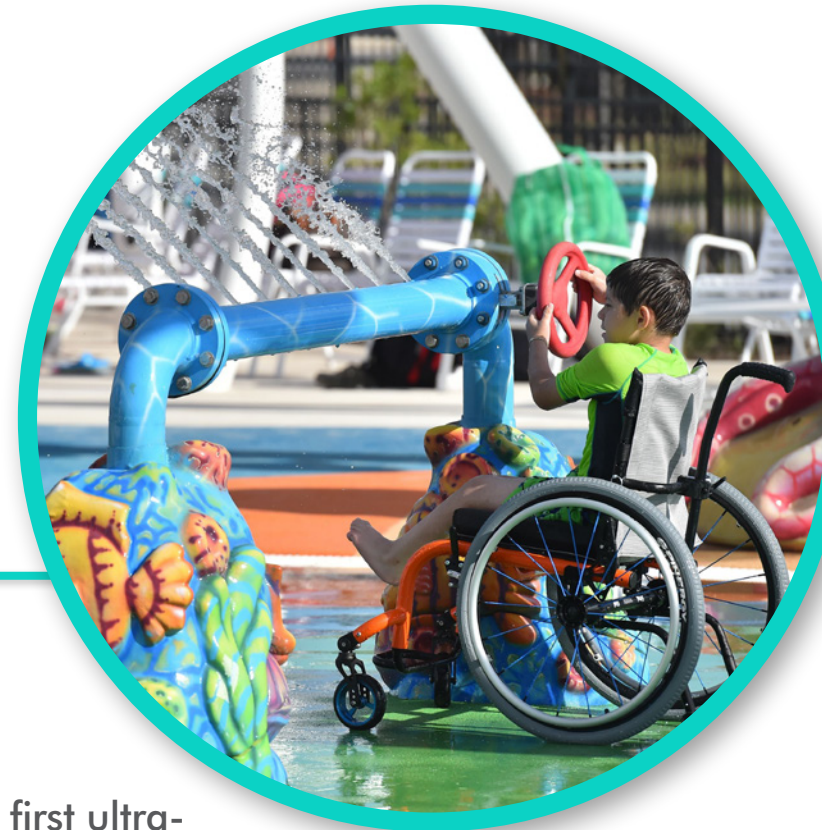
2017 The world's first ultra-accessible water park, Morgan's Inspiration Island , opens in San Antonio, Texas.