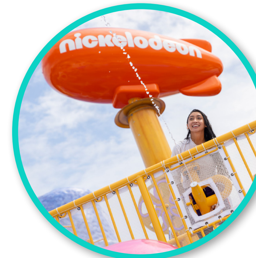
2021 Aqua Nick water park, with its 360° slime sprayer, opens in Riviera Maya, Mexico.