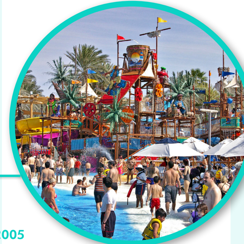
2005 WhiteWater completes Wild Wadi expansion.