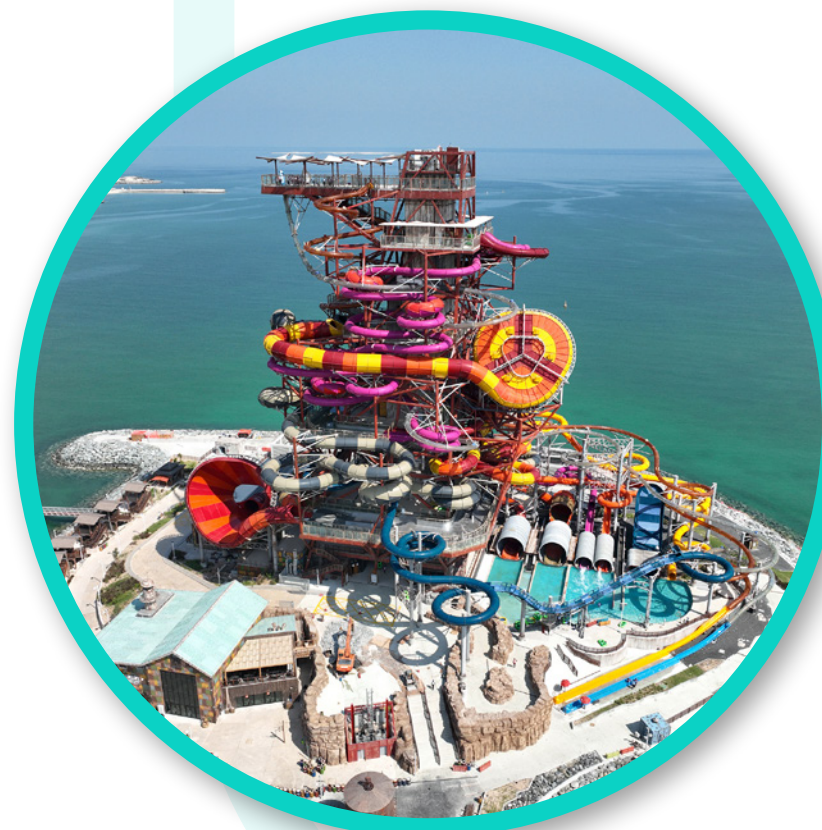
2023 Meryal , with its world-record-breaking Icon Tower vertical water park opens in Qatar.