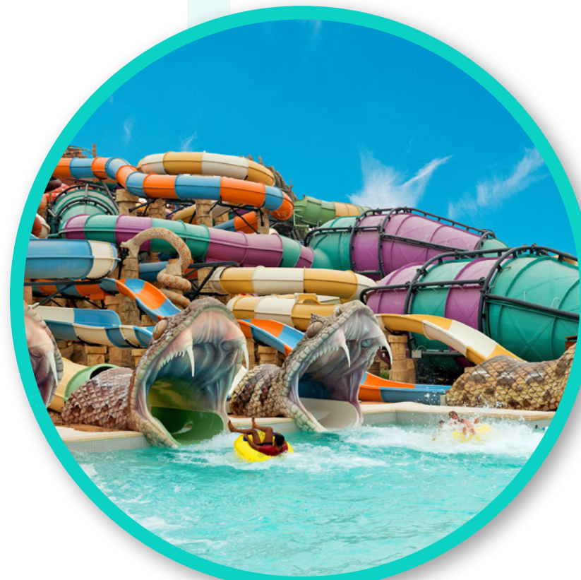
2013 Yas Waterworld , with its iconic Rattler slides, opens in Dubai.