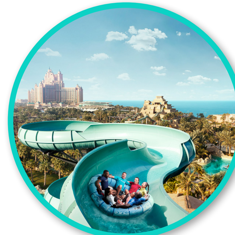
2008 Aquaventure Waterpark at Atlantis Dubai opens.