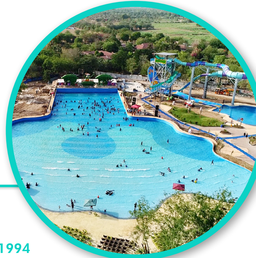
1994 Shankus Waterpark , India's first water park, opens.