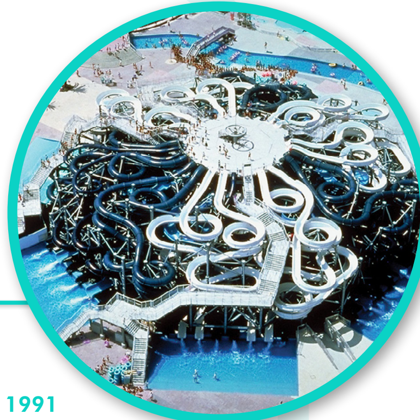
1991 Rokko Island , a world-record- breaking tower of 50 water slides opens.