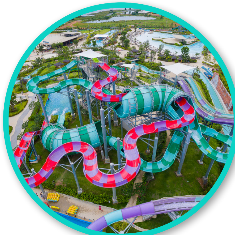
2016 Thailand's largest water park, Ramayana , opens.