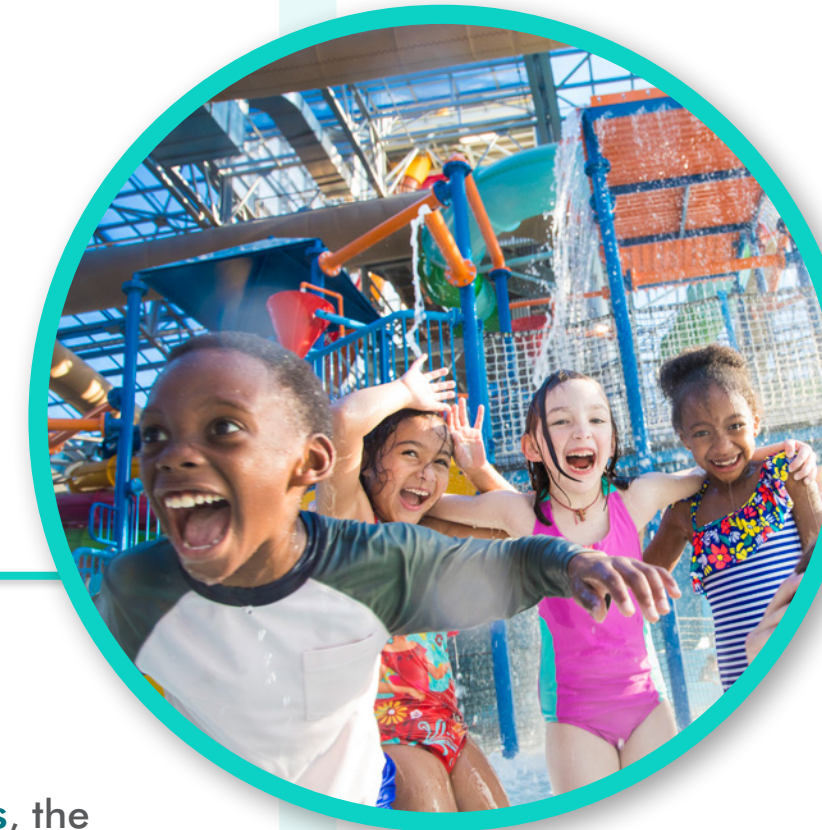
2018 Epic Waters , the largest parks and recreation project in the US opens.