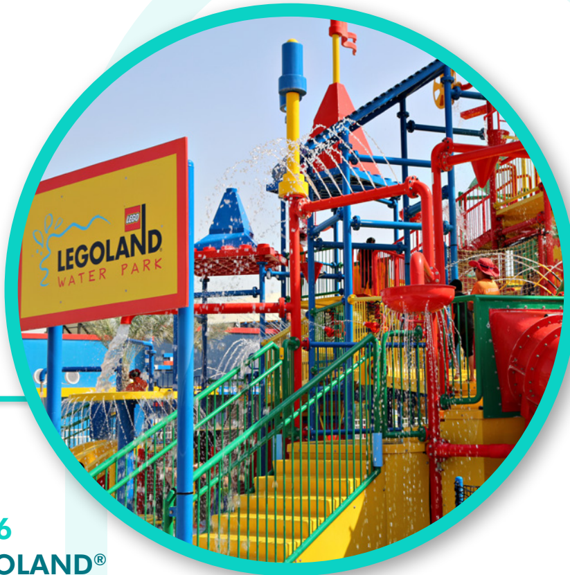
2016 LEGOLAND® Dubai opens.